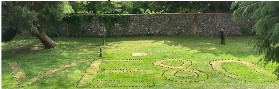
Picture of Cudham Churchyard 'VE 80'

While our churches have a vacancy for a Vicar, please email admin@pcd.org.uk or call the parish office on 01959 571515 to leave a message. Alternatively, contact one of the churchwardens below: